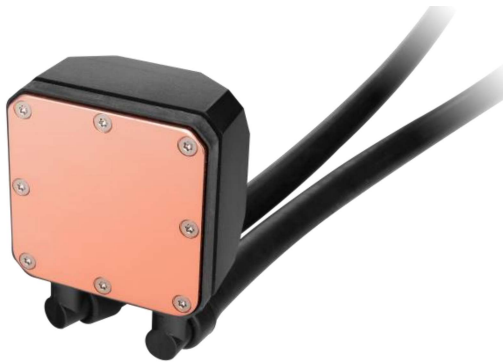
High Performance Water Block