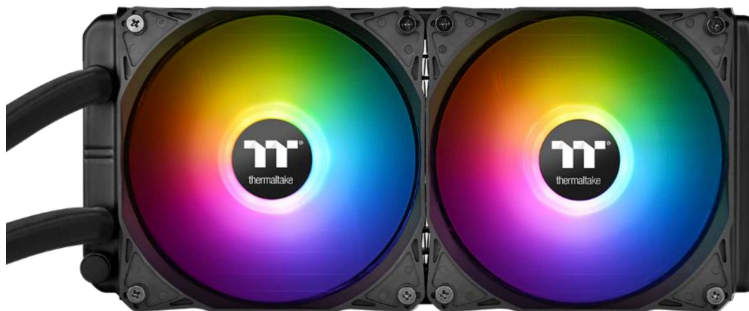
Powerful Cooling Fan